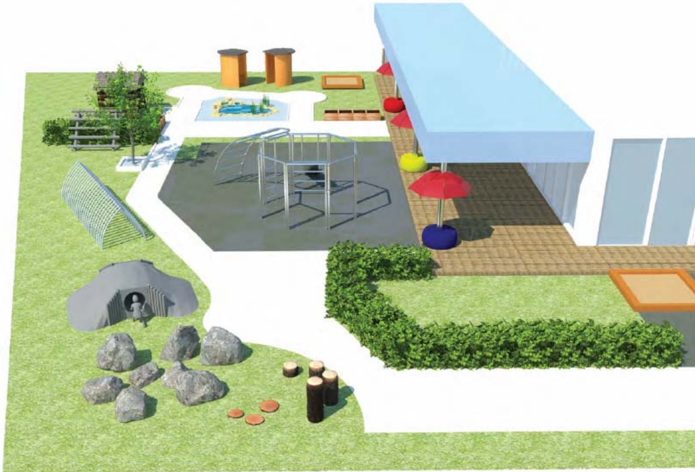
Proposed Nursery Exterior Space Layout 410-104-17