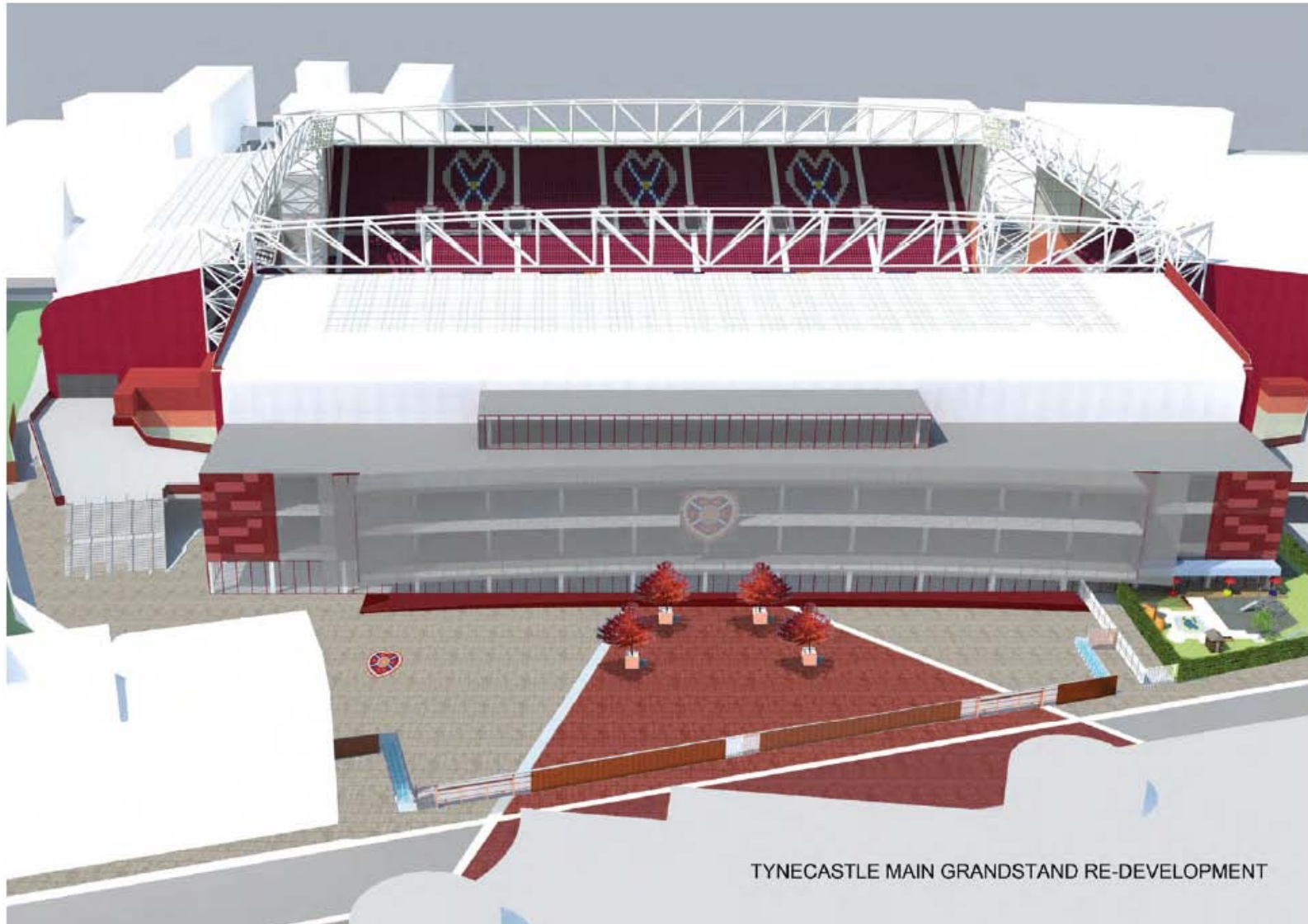
The proposed redeveloped Main Stand of Tynecastle Stadium, looking west from McLeod Street, with the nursery visible on the far right