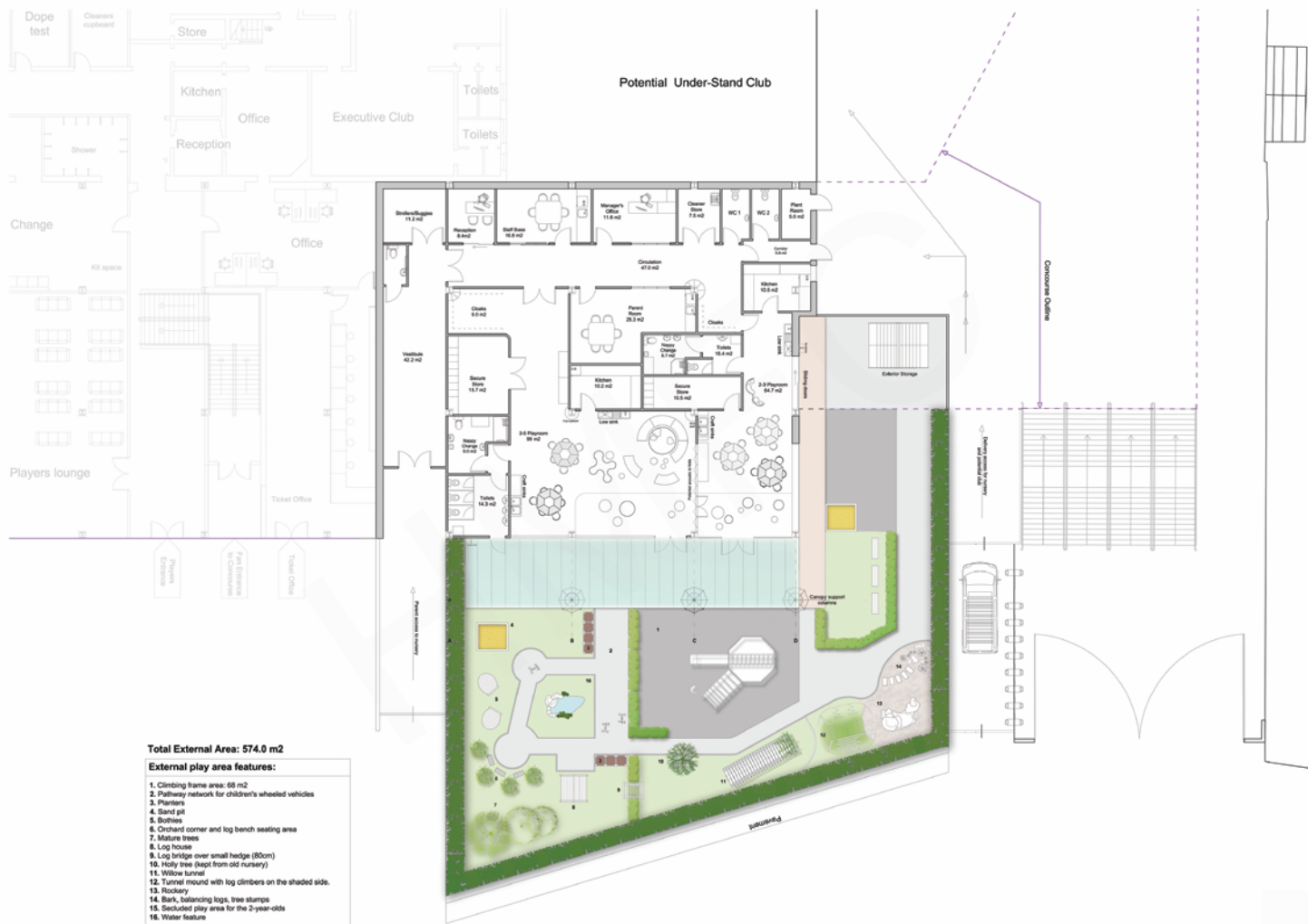
Proposed Nursery Layout 410-104-15