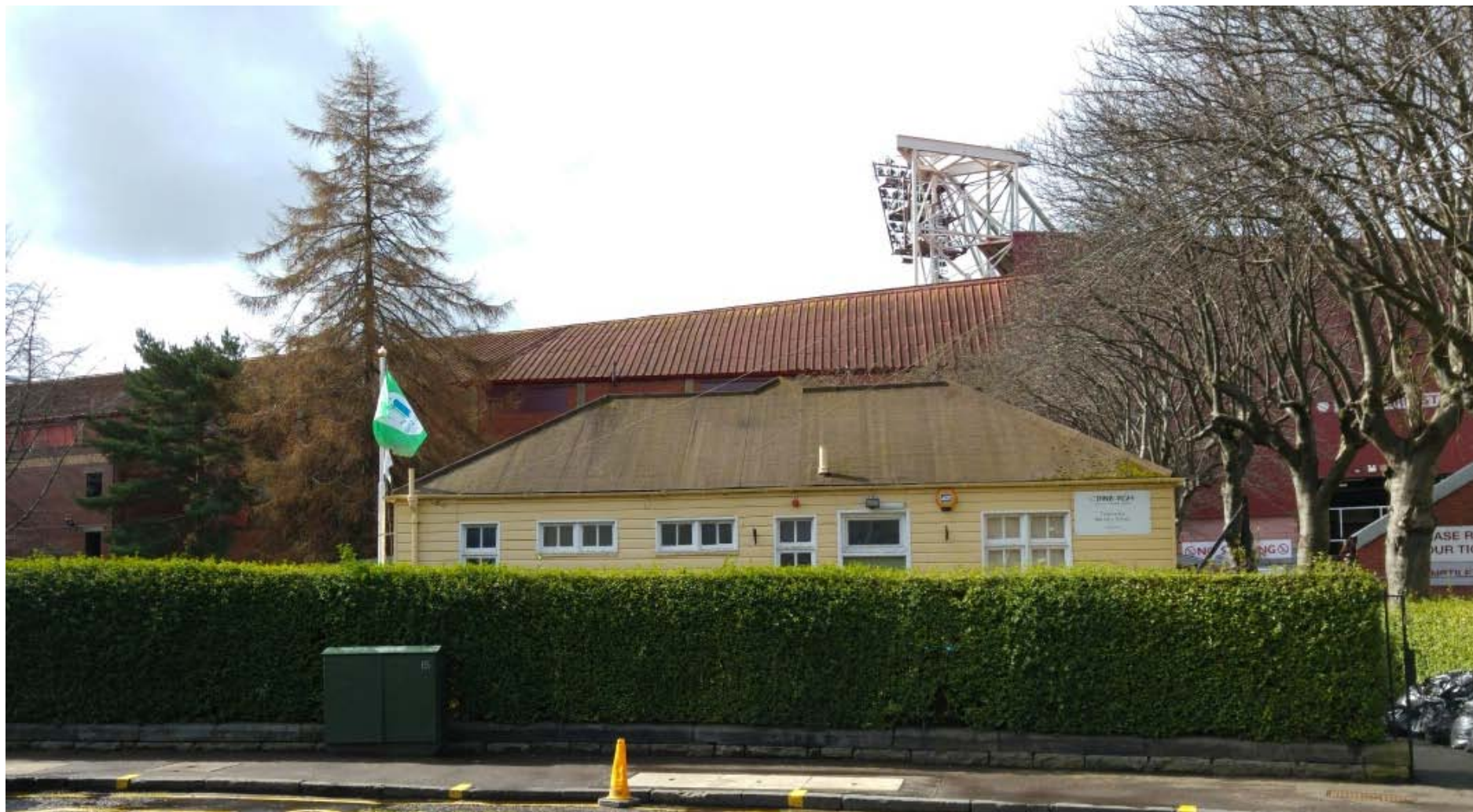
The existing nursery with Tynecastle Stadium to the rear, looking west from McLeod Street